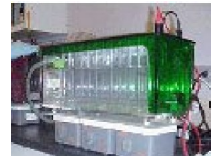
Simultaneous 2D gel Electrophoresis

The company's BC-SeraPro™ blood serum test not only shows great promise in diagnosing breast cancer in individuals, but perhaps more importantly, it brings a not too distant future, a reality in which women will no longer have to experience uncomfortable mammograms, whose results very often give false negatives/positives for breast cancer. The test is also important because, today, by the time breast cancer is detected, it has already been present for six years.