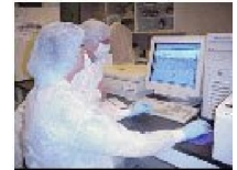
2D gel image analysis

Today, their scientific team is on the leading edge of the proteomics industry through their discovery of protein footprints, pathways, and mechanisms of disease. These discoveries are being used to develop screening and diagnostic tests for the early detection and treatment of disease. The protein biomarkers, drug targets, and diagnostic tests are targeted toward markets with critical unmet needs in areas such as breast cancer, neurodegenerative disease and drug resistance in cancer. The Company is in a strong competitive position with over 190 identified biomarkers and a state-of-the-art proteomics laboratory.